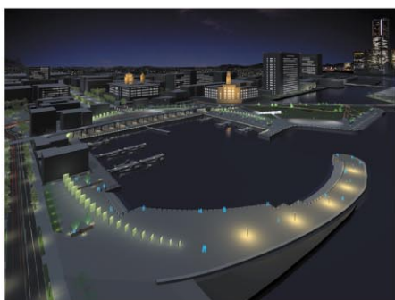
Image of night view of Zou-no-Hana-District