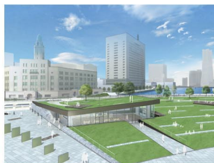
Image of a completed multi-purpose rest house

Why is it called Zou-no-Hana (elephant trunk)?...When the Port of Yokohama was opened in 1859, two linear quays, the East quay and the West quay, were made. In 1867, the East quay was remade into an elephant-trunk-like curved shape, which eventually came to be called "Zou-no-Hana".