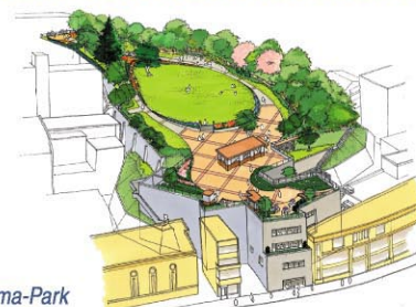
Image of the development of Americayama-Park