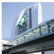
International Triennale of Contemporary Art Yokohama 2001

Dates : September 13 ~ November 30, 2008 (79 days) Location : Shinko Pier, Red Brick Warehouse Building#1, BankART Studio NYK, etc