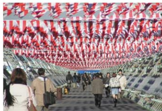
International Triennale of Contemporary Art Yokohama 2005