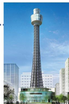
Image of the renewed tower