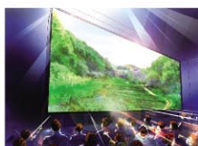
Y150 Dream Front