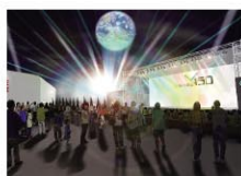
Y150 Tomorrow Park