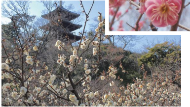
▲ Sankeien (Sankeien Garden)

The red and white flowers begin to bloom while it is still cold, giving you the feeling of spring. There are about 300 plum trees in Negishi Forest Park, and about 500 in Sankeien Garden (admission charged, open 9:00 a.m.-5:00 p.m.).