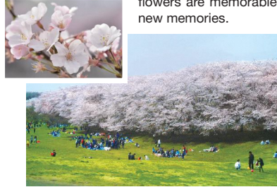
▲ Negishi Shinrin Koen (Negishi Forest Park)

The cherry blossoms bloom along the road at the same time, in nearby parks, and in school yards throughout the ward. Since it coincides with school graduations and entrance ceremonies, these flowers are memorable for new memories.