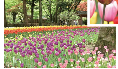
▲ Yokohama Koen (Yokohama Park)